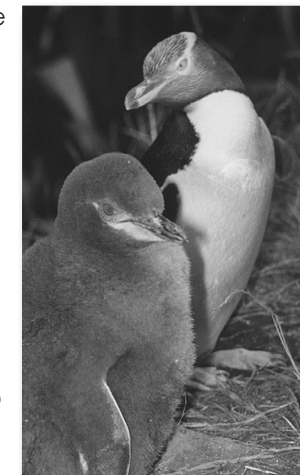
YELLOW-EYED PENGUIN ADULT & CHICK

9 RELIC DUNES. You may have noticed the hummocky nature of the area you have just been walking over. These are relic dunes some of which are several thousand years old. Approach the beach cautiously. There may be NZ sea lions resting on the track.